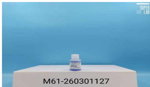
Figure 1 : Test article.