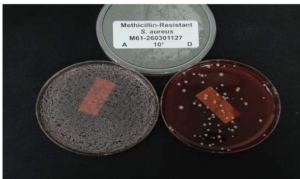
Figure 2: Result of control and test group.

Strains : Methicillin-Resistant Staphylococcus aureus